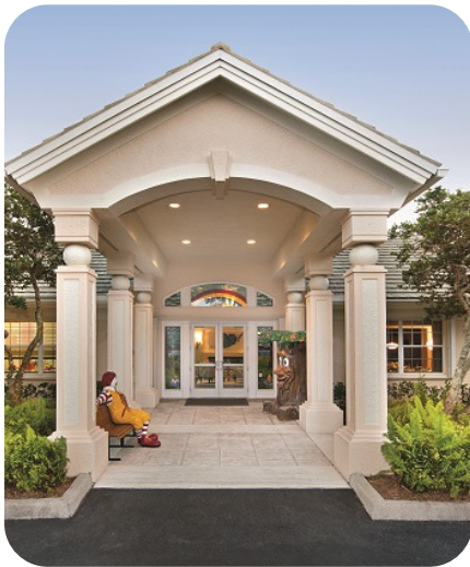
Ronald McDonald House®