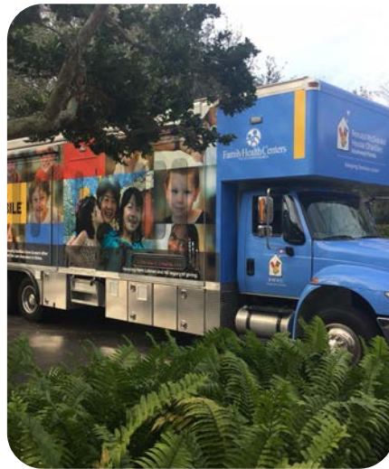
Ronald McDonald Care Mobile® Program